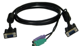
PS2 KVM Cable